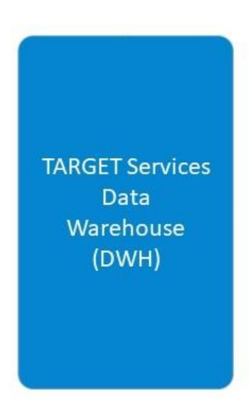
Figure 1 - High level DWH coverage

Each component of the T2 Service and T2S has its dedicated production database. The DWH consolidates the content of those production databases into a single database for operational and statistical purposes for the operator, CBs, ancillary systems and payment banks. It is ensured that the provision of data from production databases to the DWH does not influence the functioning and availability of the T2/T2S Services and the respective underlying production databases.